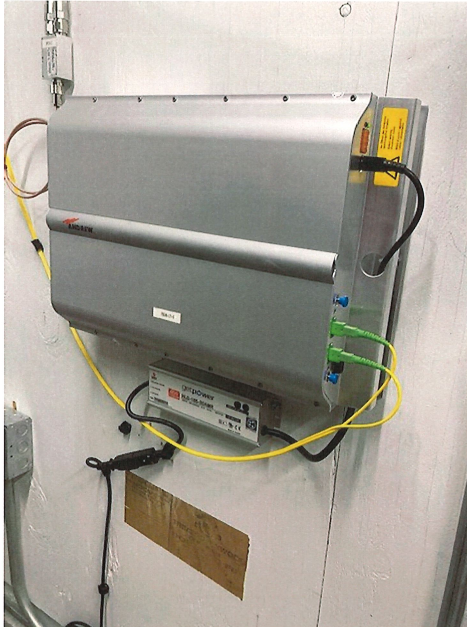
Distributive Antenna System (DAS) Repeater