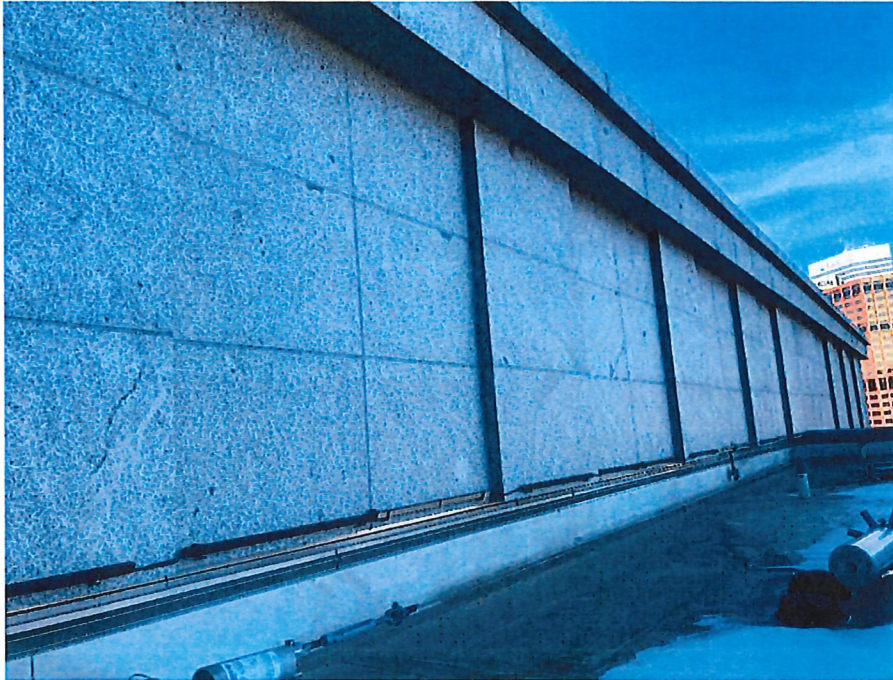
Existing LED lighting fixtures at Court's parapet that have failed and require replacement.