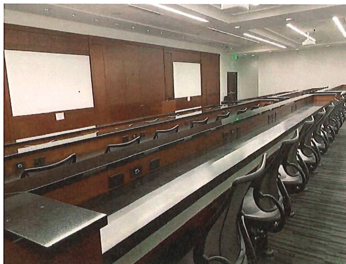
Conference Room "D".